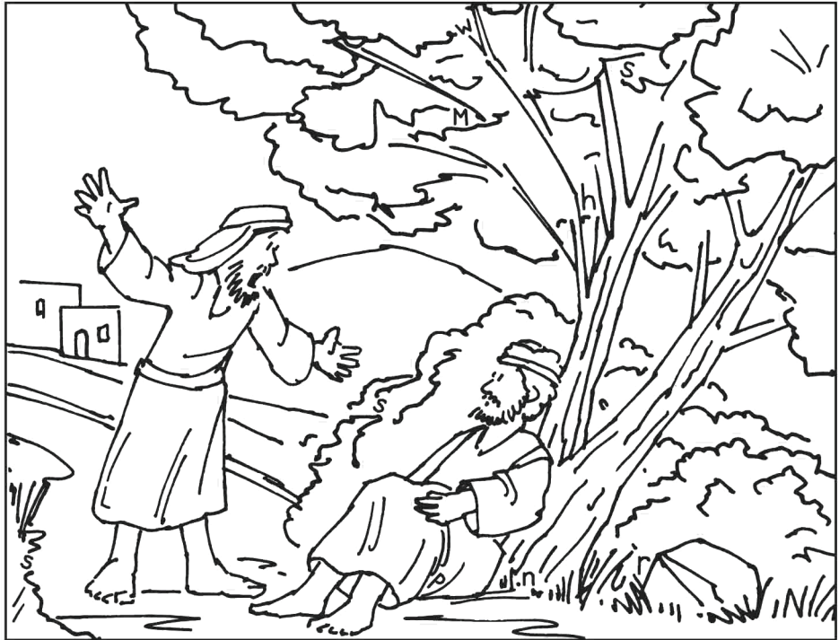
St. Paul Catholic Church

Find the underlined letters hidden in the picture below. “We have found the One Moses wrote about in the Law , and about Whom the prophets also wrote – Jesus of Nazareth , the Son of Joseph .”